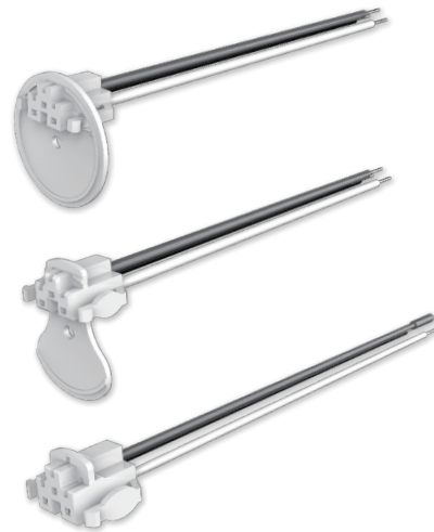
Figure 1: Legacy Kidde harnesses

After installation, turn on AC power and be sure that the AC power indicator is operating and test all your alarms following the instructions supplied by the alarm manufacturer for your specific alarm model. If the alarms are interconnected push the test button on each alarm and verify that all the interconnected alarms sound when any alarm is activated. The interconnect system should not exceed the NFPA interconnect limit of 12 smoke alarms.