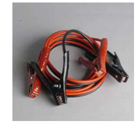
Item # M64074 U/M - Each